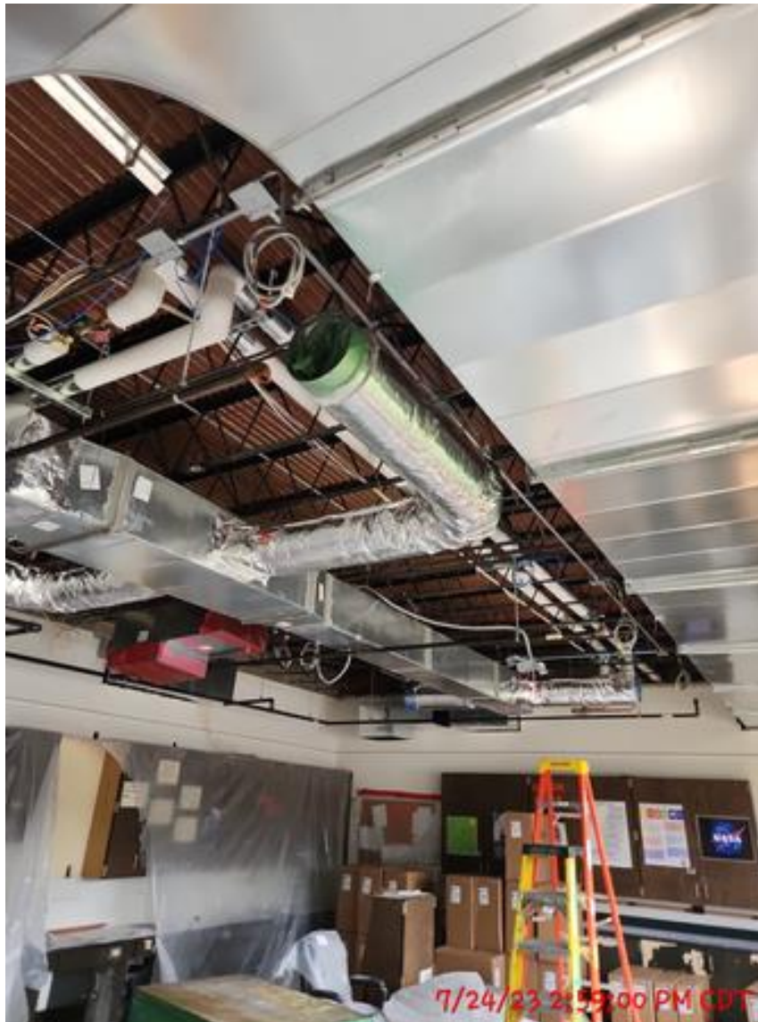
New Ductwork & Insulation