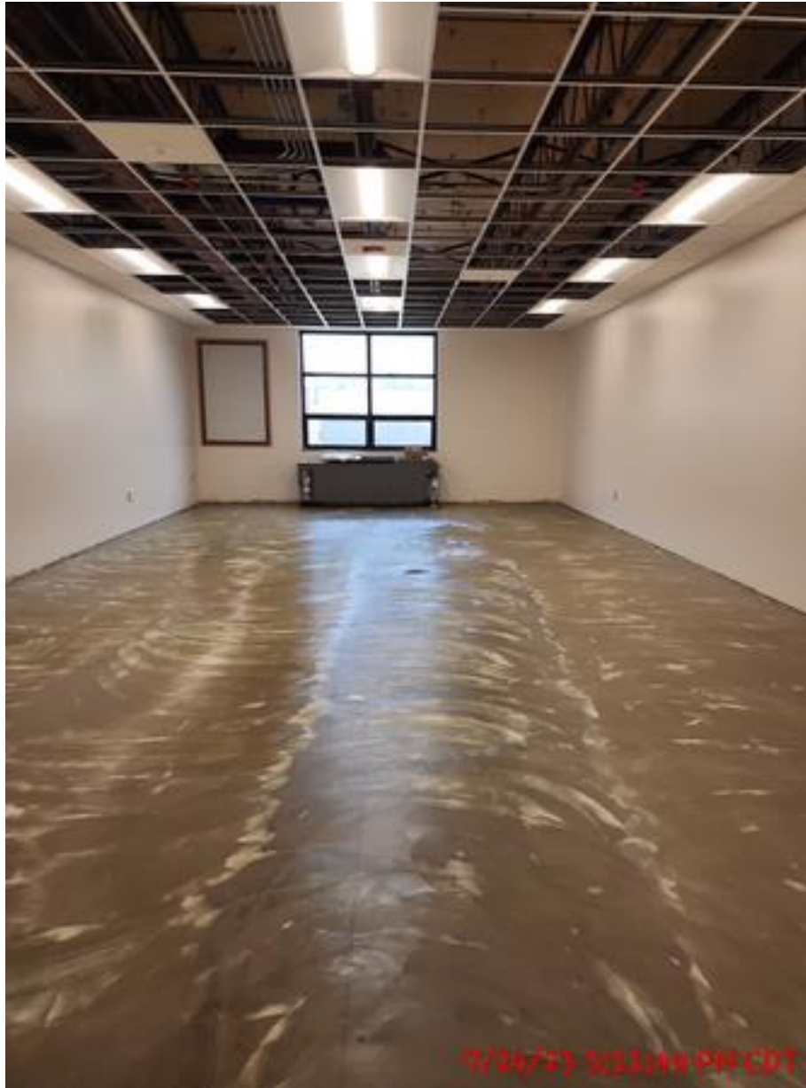
Finished Floor Prep