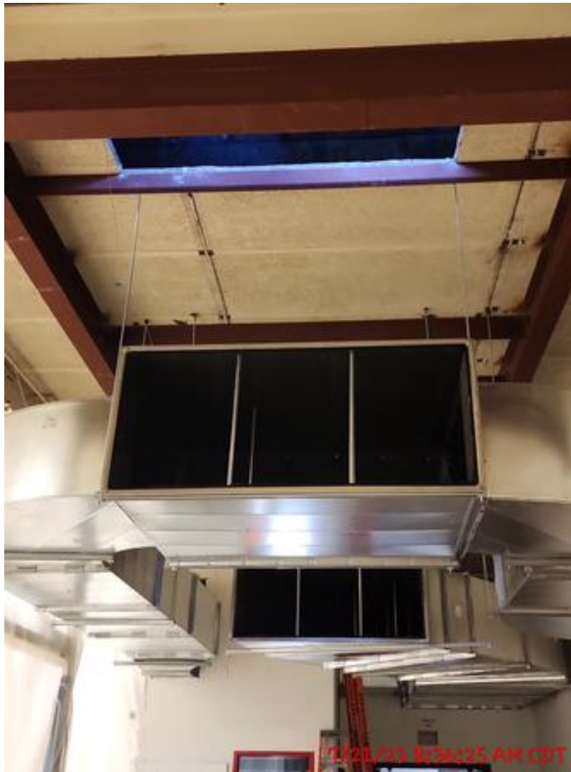
Ready for RTU 1