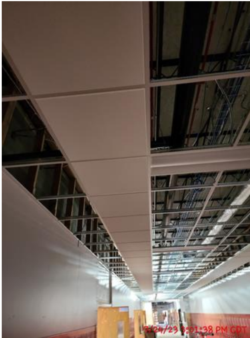
Ceiling Grid & Tile Installation