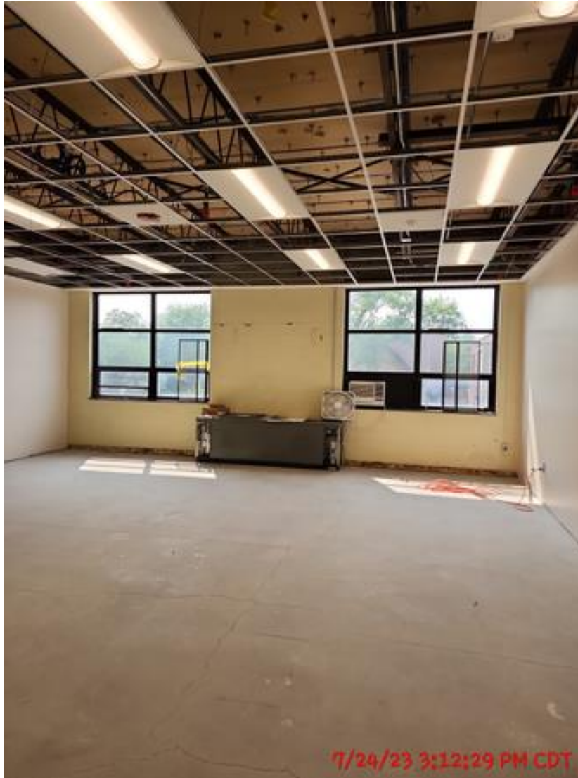
Finished Floor Leveling