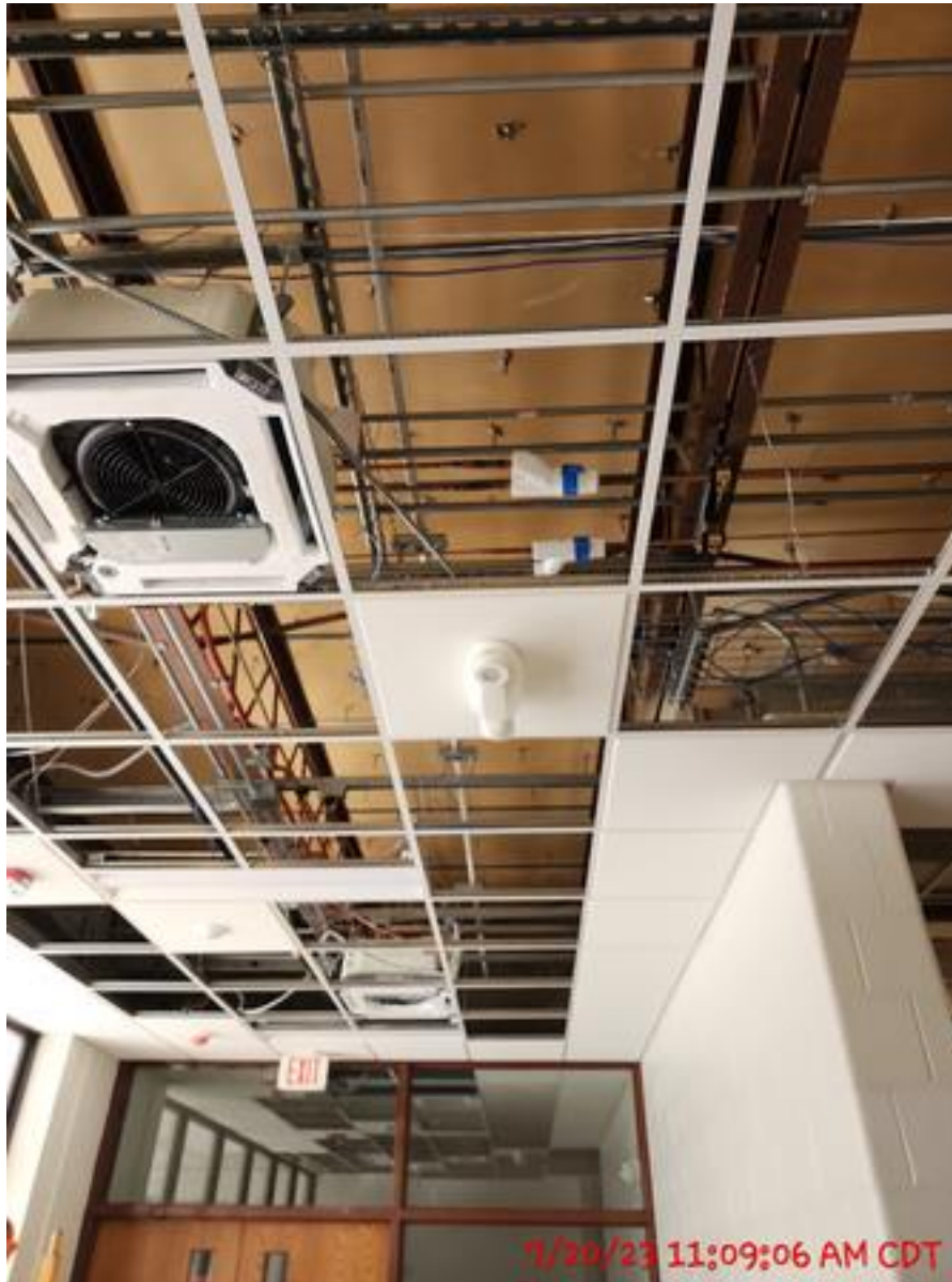
HVAC Casser Installed in Ceiling